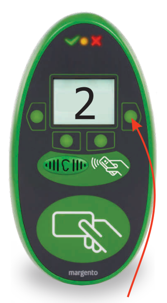
Please, choose the appropriate zone on the validator.

Payment with Urbana enables all passengers to travel within 90 minutes within a selected number of zones. The zone in which your journey starts is always in Zone 1; if you travel futher on, the Zone 1 is followed by Zone 2 or / and then by Zone 3.